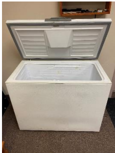
7 cu.ft. Danby freezer

Yes, FREE on a first come first for FREE basis. You must arrange to carry away.